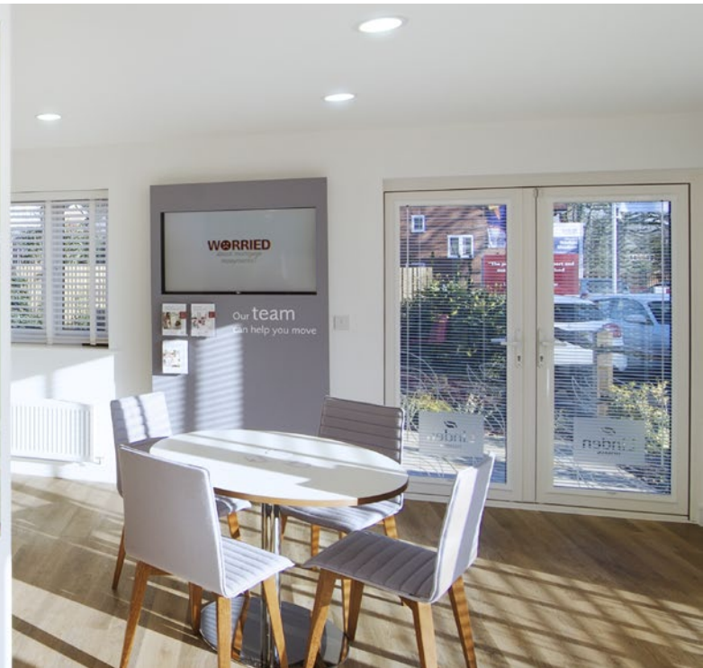
Shinfield Meadows, Berkshire - Internal Marketing Suite